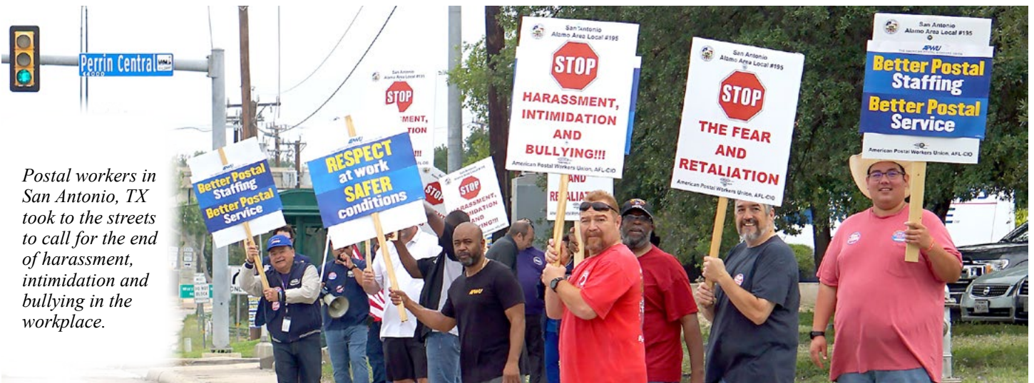
Postal workers in San Antonio, TX took to the streets to call for the end of harassment, intimidation and bullying in the workplace.

At the Philadelphia P&DC, local and state members from across Pennsylvania and southern New Jersey were joined by letter carriers and mail handlers for a press conference and informational picket.