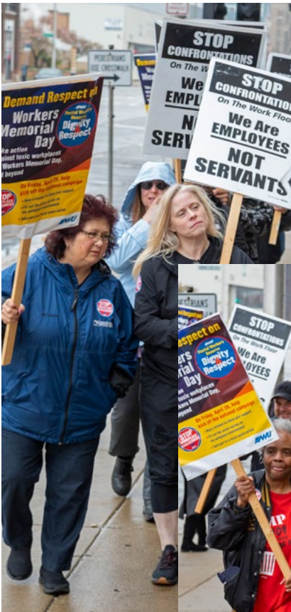
Postal workers in Detroit, MI rally for dignity and respect in the workplace.