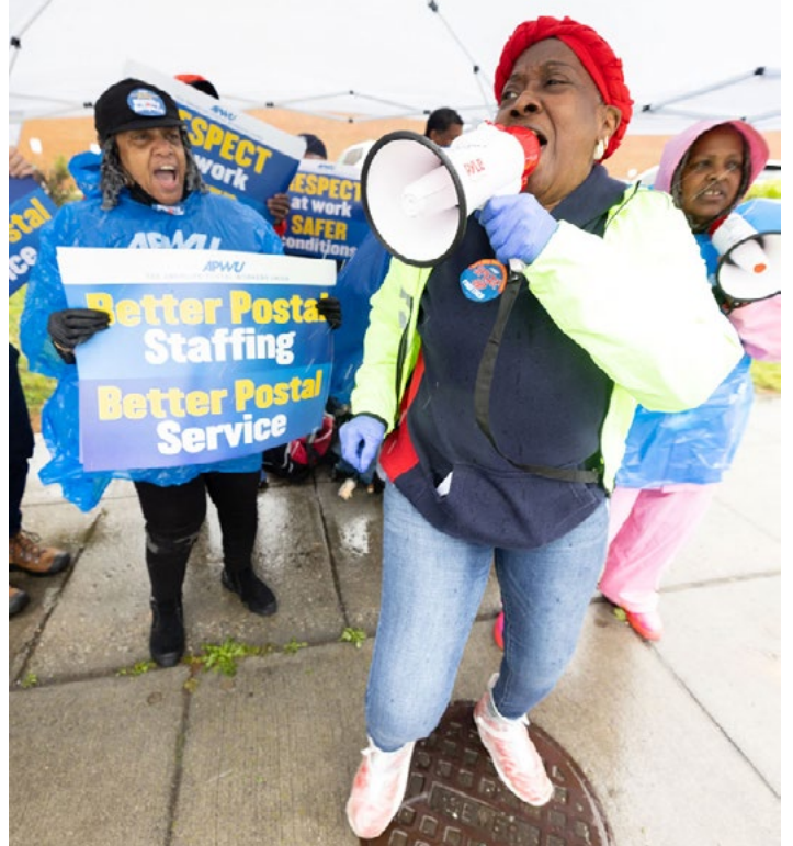
Despite heavy rain, rally-goers at the Brentwood P&DC day of action in Washington, DC were "fired up and ready to go!"

To see more highlights of the Workers Memorial Day of Action and to find out more about the ongoing campaign for respect, visit: apwu.org/respect .