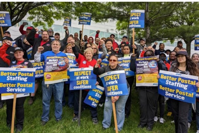
Postal Workers from Pennsylvania and New Jersey demand better staffing and service on Workers Memorial Day.

There were approximately 60 rallies and other solidarity events across the country.