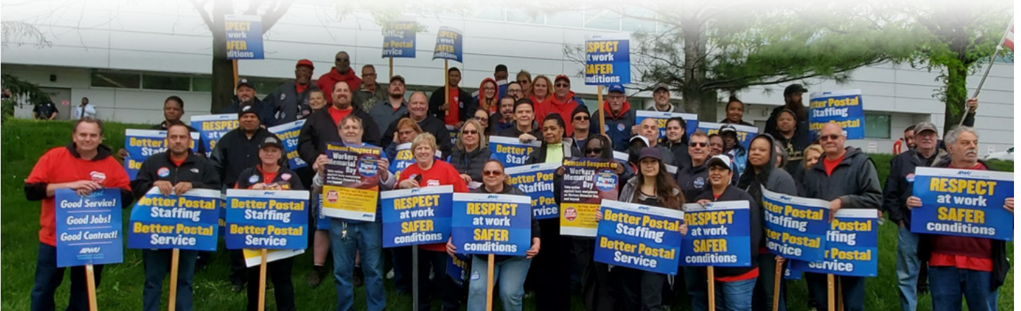
Members of the Philadelphia, Keystone, Lehigh Valley, Lancaster, and Eastern Montgomery County area locals, and the Pennsylvania APWU rally together in support of Better Staffing and Better Service on Workers Memorial Day 2023.

It is unacceptable that post offices nationwide face staffing shortages, which cause long lines and unfair delays to our community. We call on the Postal Service to sufficiently staff our post offices so the public receives the “prompt, reliable, and efficient” service mandated by law.