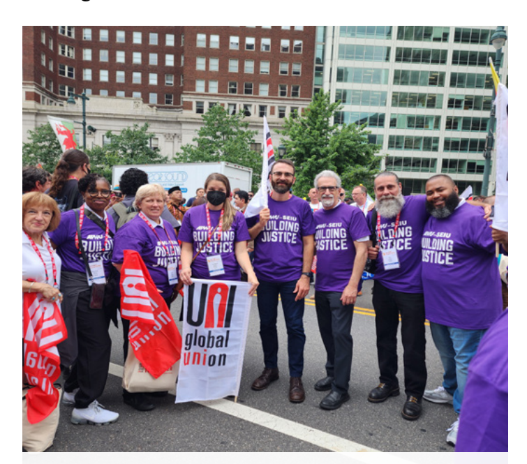
APWU delegates to the UNI Global Union World Congress joined SEIU 32BJ members at a contract rally in Philadelphia as they fought for better pay and health and safety.

In the last few weeks, many APWU members have joined UAW rallies, picket lines, and signed petitions, understanding that "an injury to one is an injury to all," and that when workers rise anywhere, we all rise together.