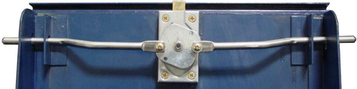
Figure 3. PSIN 1170K Collection Box Locking Rods

Verify that the mailbox locking rods are securely connected to an Arrow Y Lock and function properly. See Figure 3 below for an example of a proper installation (shown is a PSIN 1170K Collection Box).