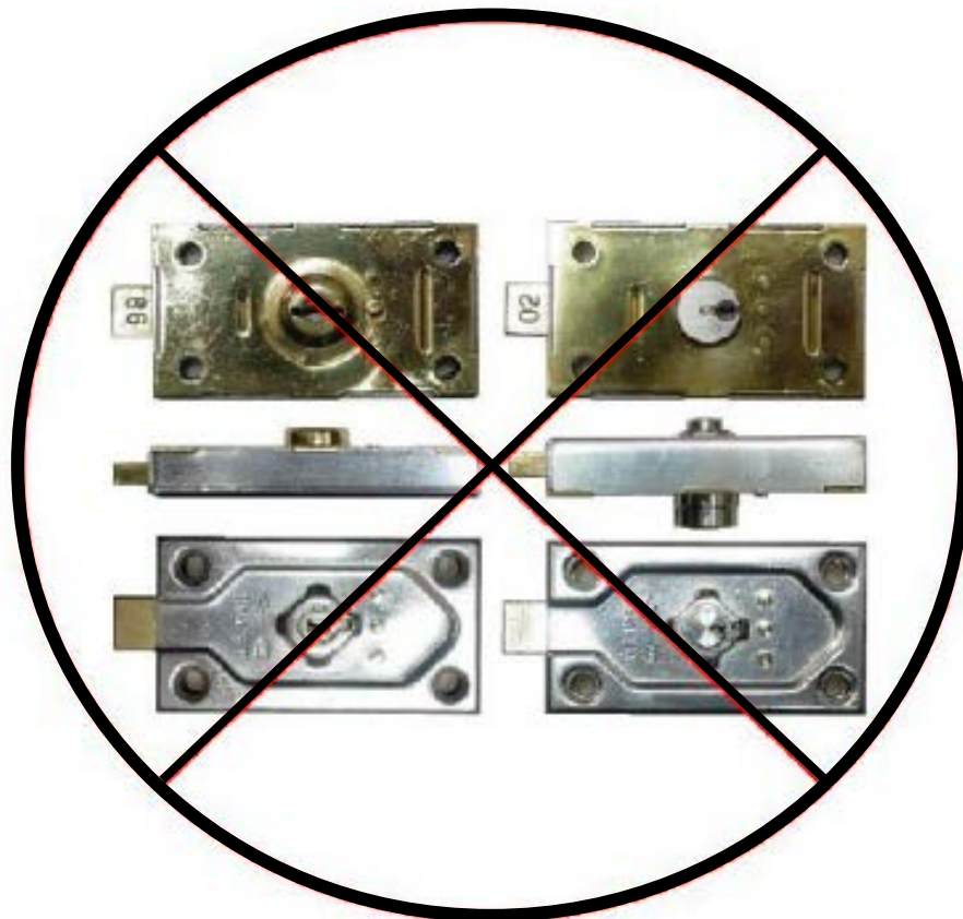
Figure 1. Arrow Locks Prohibited on Collection Boxes - (DO NOT USE)

Do not use Arrow locks without swivel plates on any collection boxes (Figure 1).