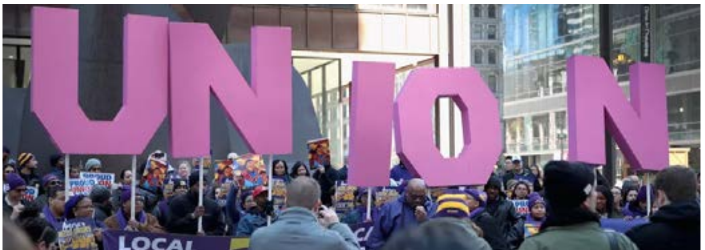
A Chicago rally in favor of the American Federation of State County and Municipal Employees (AFSCME) in the Janus v. AFSCME case.

The PRO Act has already passed the House but is still pending before the Senate. APWU is continuing to press the Senators who have not yet cosponsored the bill, particularly in Virginia and Arizona, to join. To date, the bill has 47 cosponsors.