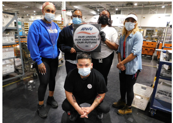
Gary Area Local (IN)

provisions” – wage increases, COLA, step increases, etc.