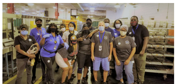
Rocky Mount Local (NC)

Take a masked selfie or group picture with your masked coworkers while wearing your union sticker or other union gear and email it to ncc@apwu.org . Be entered in a raffle to receive more union gear! Remember to send high resolution photos at their “original” file size. If you post photos on social media make sure you tag #APWUUnited and @APWUNational!