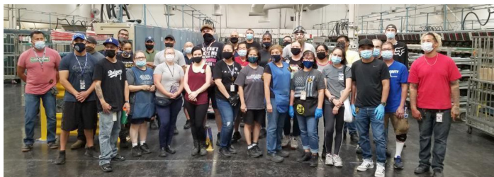
Bakersfield Area Local (CA)

The APWU will submit additional proposals in the coming weeks including ones for “economic