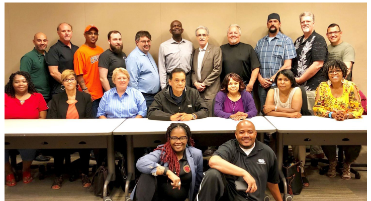
Workplace Environment Committee Members with National Officers.