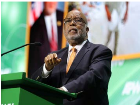
Congressman Bennie Thompson speaks to delegates about threats to democracy.

Ellison touched on the rise of public support in the U.S. for unions in recent years. With two-thirds believing unions help the overall economy, he proclaimed, "America loves unions, and they love you." He challenged delegates to continue their political activism and stand in solidarity with organized labor. He remarked, "For a future we can believe in, we've got to get to work."