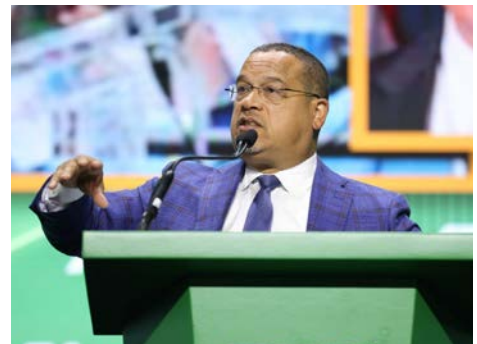
Attorney General Keith Ellison praises postal workers for their successful legislative actions.

Keith Ellison, Minnesota Attorney General, addressed delegates on the ongoing threat to democracy, our jobs, and fighting for the future that we deserve. He praised postal workers for their advocacy, organizing, and successful legislative actions - all while continuing to do our jobs through a deadly pandemic. "Prosperity, and rights, and a voice on the job, that's what it's all about," he remarked.